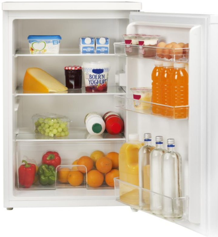
Table Top Larder EDTK5509